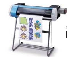
Optional Stand PNS-24